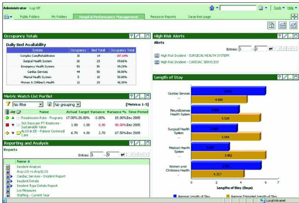
Figure 3: Dashboards provide critical information at-a-glance. From there, you can drill into additional detail or analysis.

The concept of performance management is not new—it is merely the formalization of good management practice. What is new is the ability to support these processes with an integrated set of tools, so that: